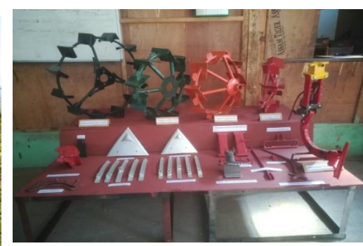
Some spare parts and accessories are manufactured to substitute the import