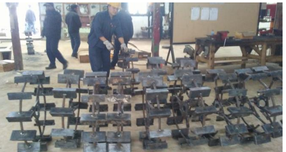
Manufacturing of Cage wheel for Power tiller